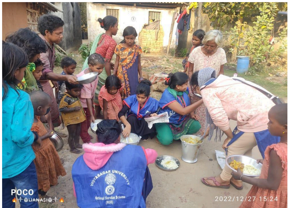
Food distribution in the adopted village, Satyanban pally