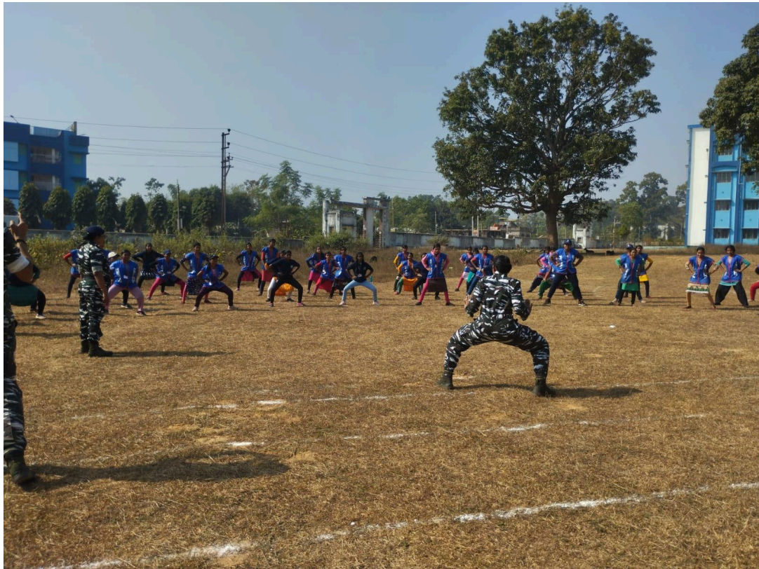
Demonstration of Self defence

Commandant, Mohila Battalion, CRPF, Salboni.