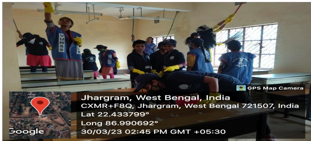
Classroom cleaning Programme