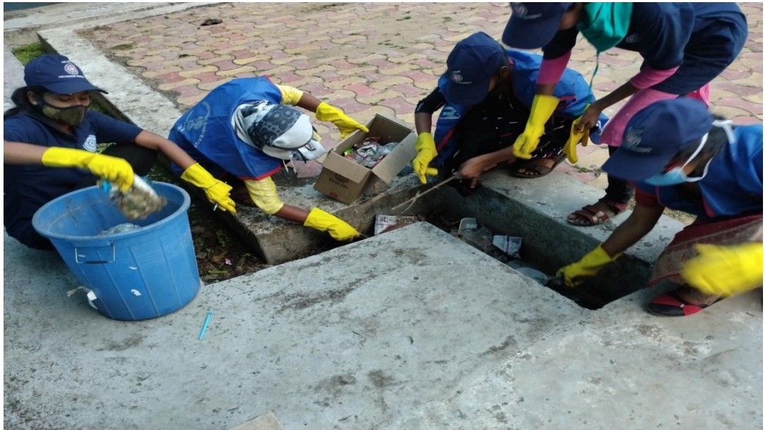
Campus cleaning programme

campus cleaning programme was organised by NSS Unit-1.